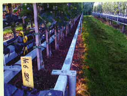
Fig 3. Hydroculture shrub growing with 20% BioFoam in the substrate

Within the project, various strategies were successfully investigated to produce modified BioFoam granules. This is covered by a pending patent. BioFoam was made in several variants that can absorb amounts of water and had adjustable densities and bead sizes, both in round and cubic shapes (see figs. 1 to 6). ▶