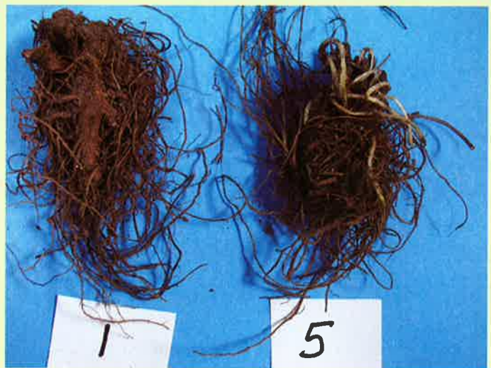
Fig 7. Phlox after transport with traditional transport protection (1) and with BioFoam (5) leads to a much improved preservation and quality of the bulbs.

www.synbra-technology.nl www.wageningenur.nl/en.htm