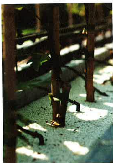
Fig 2. Shrubs grown in hydro culture covered with a 5 mm open BioFoam sheet preventing any weeds from growing.

Nursery and greenhouse potting soil is widely used as a medium for plant growth. This relates especially to pots for cultivation under glass, container-shrubs and tree cultivation. They mainly use peat as a substrate. Peat, like oil, is considered to be a non-renewable resource and its use is under pressure. Also certain markets (UK) are increasingly asking for more durable substrates, that have to be stable in use, offer acceptable end of life solutions, and preferably being biodegradable, renewable and sustainable.