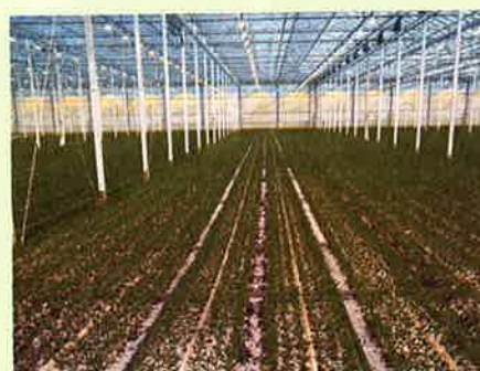
Fig 6. BioFoam greenhouse ground cover accelerates the growth of chrysanthemums due to better insulation and improved light reflection. After the growth BioFoam is mixed into the soil.