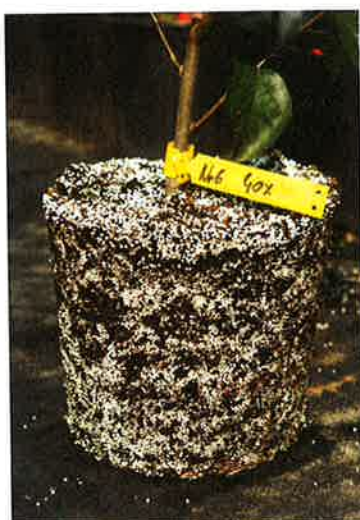
Fig 1. A shrub grown in a pot with a soil mixture of peat and 40% BioFoam.

Expanded PLA enables the production of sustainable substrates for agricultural produce, plants, trees and shrubs