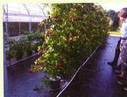
Fig 5. Raspberries grown on 20, 40, 60 and 100% BioFoam substrates in a hydroculture application.