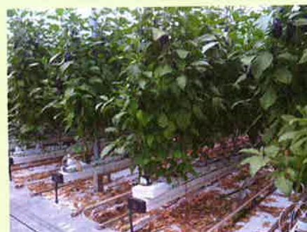
Fig 4. Eggplant (aubergines) grown on a water-permeable BioFoam cube shaped substrate replacing perlite, without any adverse effects to growth yield. It offers reduced value chain costs due to improved end of life options while preserving nutrients contained in the roots by composting.